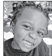
DATRAIVUS TRIMMINGS Pre-K