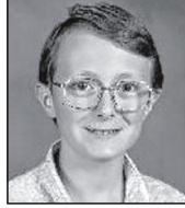
CREW WATSON 5th Grade